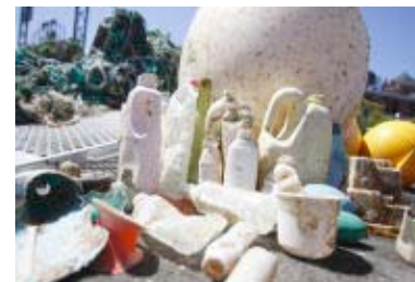
Trash found in the ocean by Project Kaisei on display in San Francisco, on...